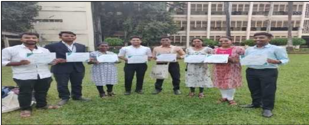
Students with certificates at IIT Bombay

Final Year Civil Engineering students participated in AAKAAR Techfest which is International Civil Engineering Symposium (ICES) paper presentation Competition of IIT Mumbai held on 16 th and 17 th march 2019. Three groups research papers are selected in booklet of International Civil Engineering Symposium-2019.